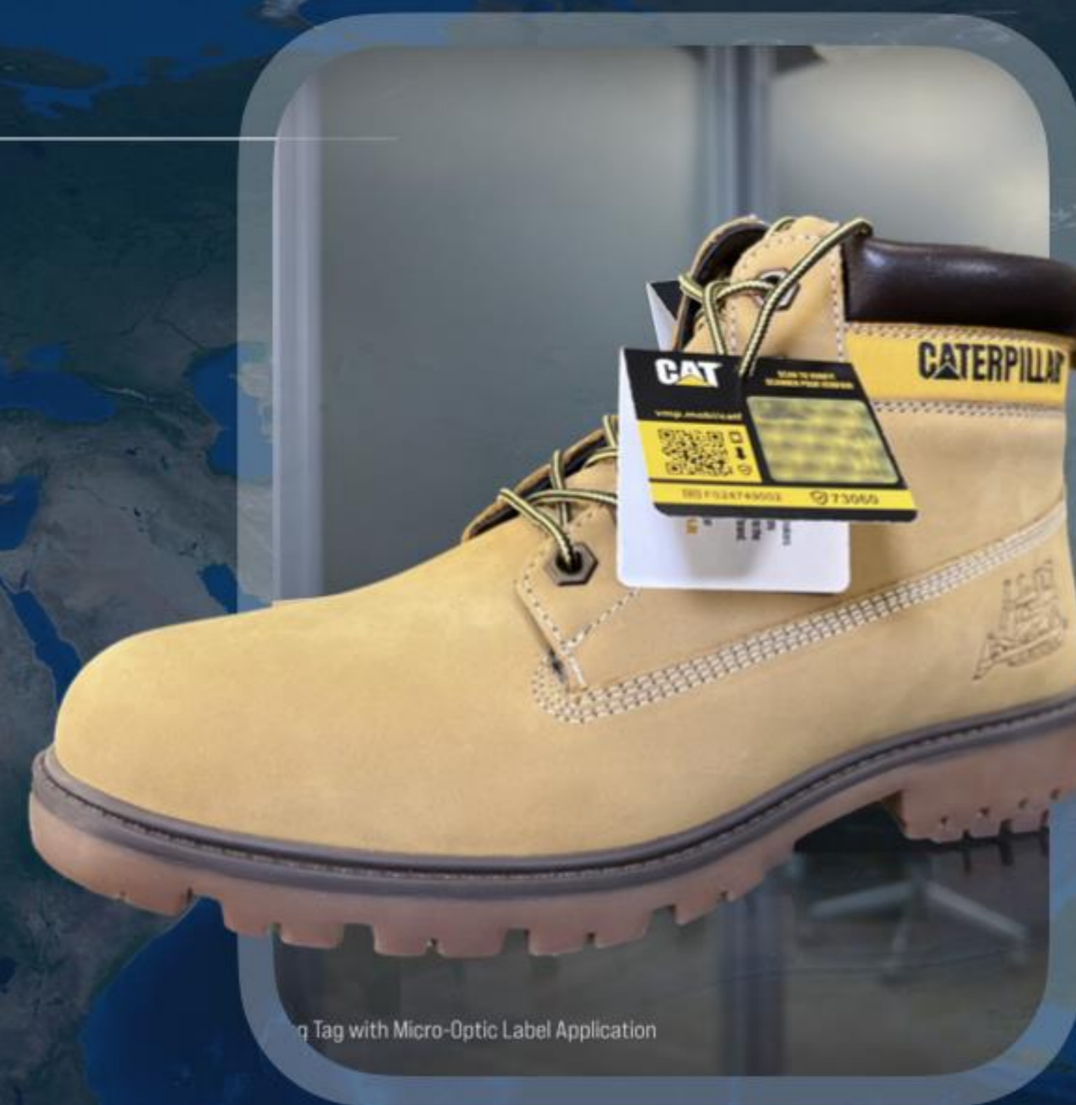
Tag with Micro-Optic Label Application